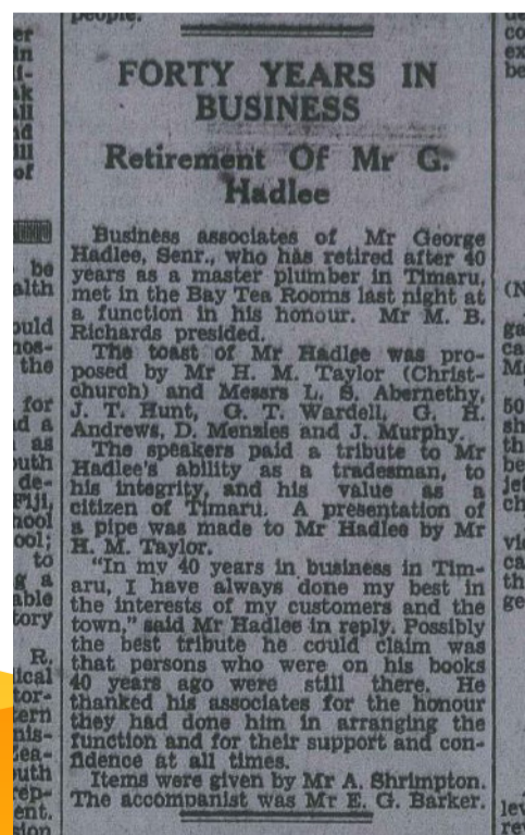
Below: Timaru Herald (October 2nd, 1946)