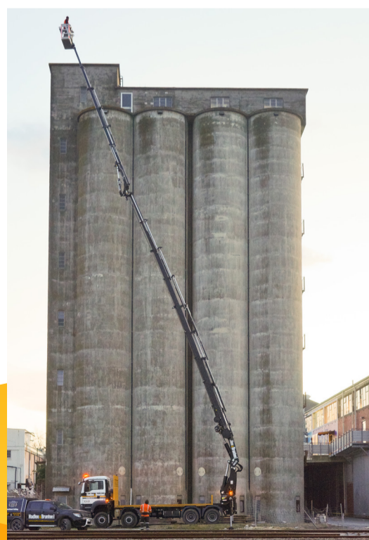
Below: Hadlee and Brunton's 54T HIAB Truck