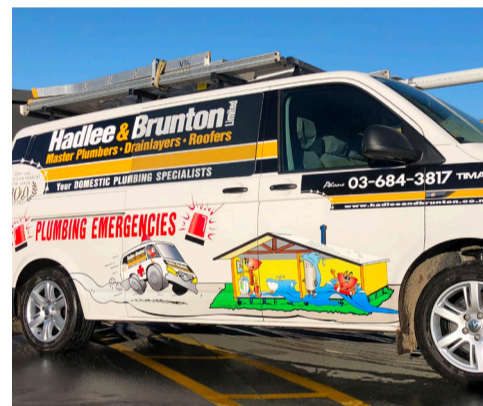
Above: One of Hadlee and Brunton's maintenance vans

"The arsenal of specialist equipment means that we have the ability to do a lot of jobs in a much smarter and cost effective way which often results in jobs costing half the price of more traditional methods. We can repair a lot of buried pipes now without digging them up. The fact our staff levels are low means we know each tradesman very well and their skill levels. Combine this with a hugely collaborative and innovative way of approaching jobs with everyone pooling their knowledge whether from a craftsman who has been with the firm for 20 plus years or an apprentice, everyone is encouraged to pitch their ideas in the hat. It makes for an extremely fun workplace and is the main reason that the firm is approached by companies and clients from all around the country when an unusual or extremely complex problem presents itself."